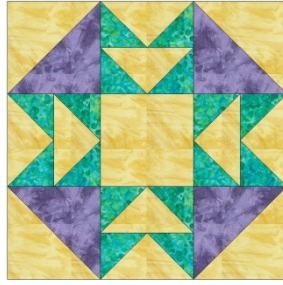
“Sweet Dreams & Sunbeams” August Block 9 1/2”