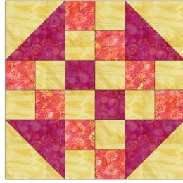
“Sweet Dreams & Sunbeams” - July 2013 Block